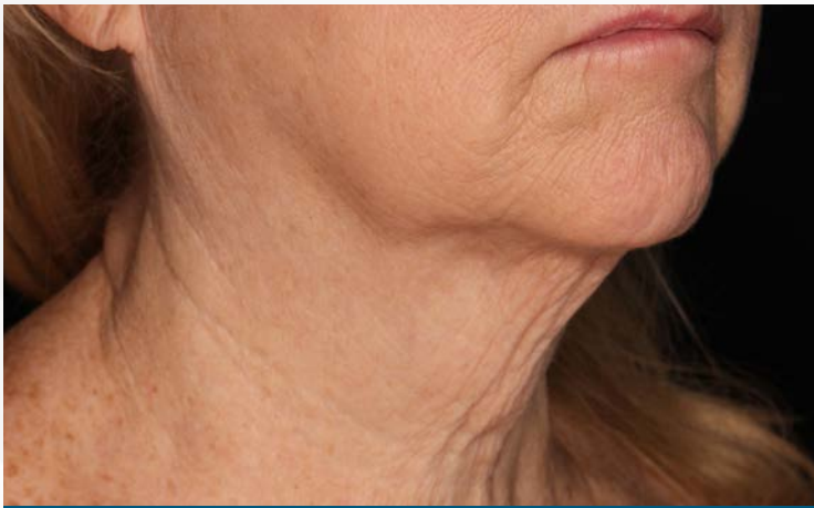
After 2 Tx